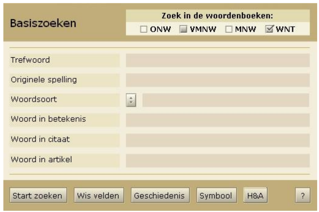
Fig. 1. The search screen of the dictionary application 'Online Historical Dictionaries of Dutch'